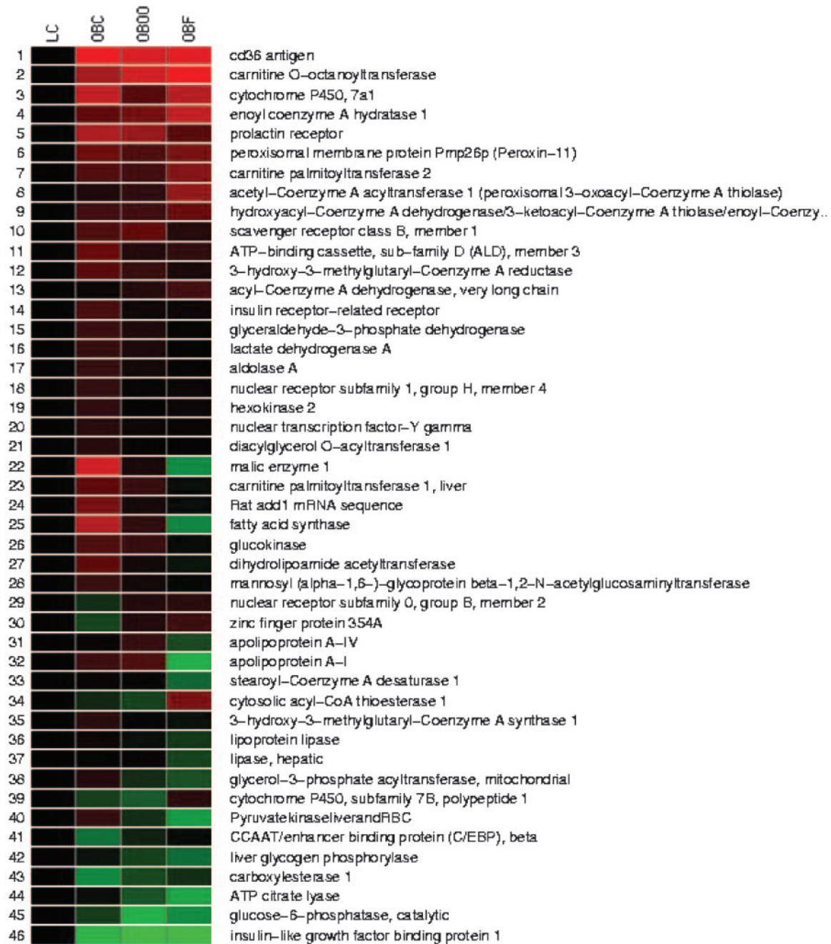
FIG. 3. Microarray analysis of metabolic genes regulated by obesity and dietary fatty acid. Data represent average expression of genes that are up-regulated (red) and down-regulated (green) by 50% or more in corpulent (obese) JCR:LA-cp rats consuming control (OBC), olive oil (OBO) and menhaden (fish) oil (OBF) diets, compared with lean JCR:LA rats consuming control diet (LC).

mitochondrial multienzyme complex, enoyl coenzyme A hydratase1, and carnitine palmitoyltransferase 1 \alpha ) was increased in livers of corpulent JCR rats (Table 6). The menhaden oil diet further increased expression of many PPAR \alpha -dependent enzymes (carnitine O-octanoyltransferase, carnitine palmitoyl transferase 2, enoyl coenzyme A hydratase 1, acetyl-CoA acyltransferase 1, very long-chain acyl-CoA dehydrogenase, and acyl-CoA thioesterase), consistent with the property of long-chain fatty acids to act as PPAR agonists (37). Other PPAR \alpha -responsive enzymes [acyl-CoA oxidase and uncoupling protein